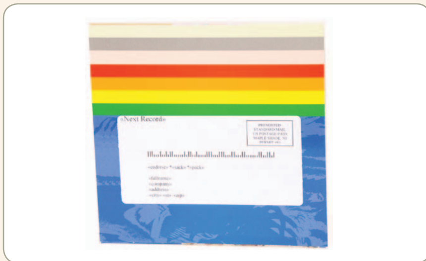
This illustration shows the correct placement of the address panel for this template.